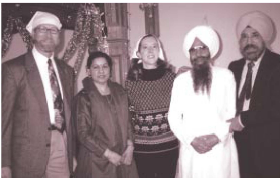
As part of the Spirit & Place Festival in November, Sikh Gurudwara Temple invited the public to attend a religious ceremony and information session.