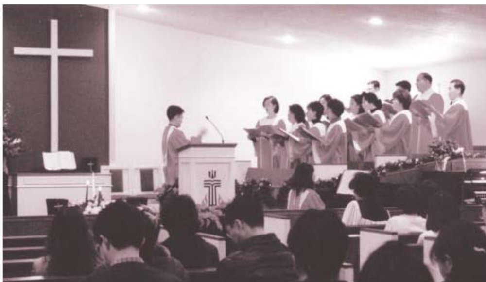
Sunday services, Korean Presbyterian Church of Indianapolis.