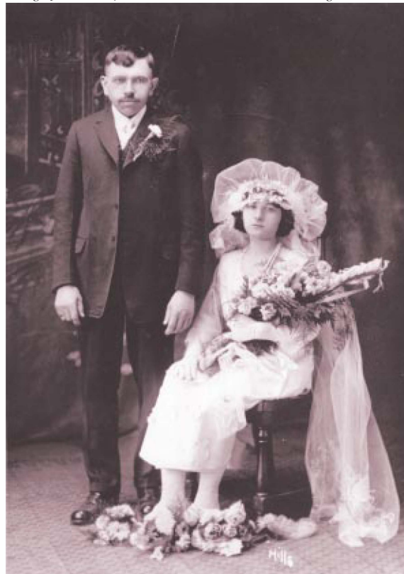
Slovene immigrants, wedding ceremony at Holy Trinity Catholic Church, Haughville neighborhood, ca. 1923.

(neg. # C1785)