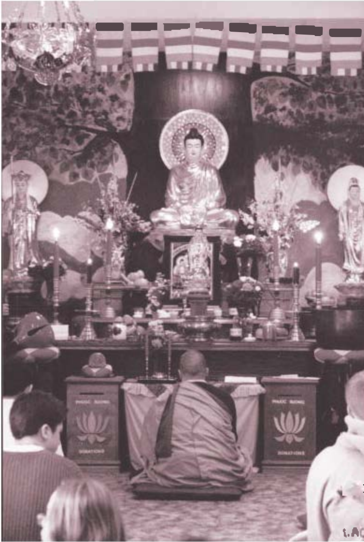
An Lac Temple: the visual richness of Buddhist ceremony.