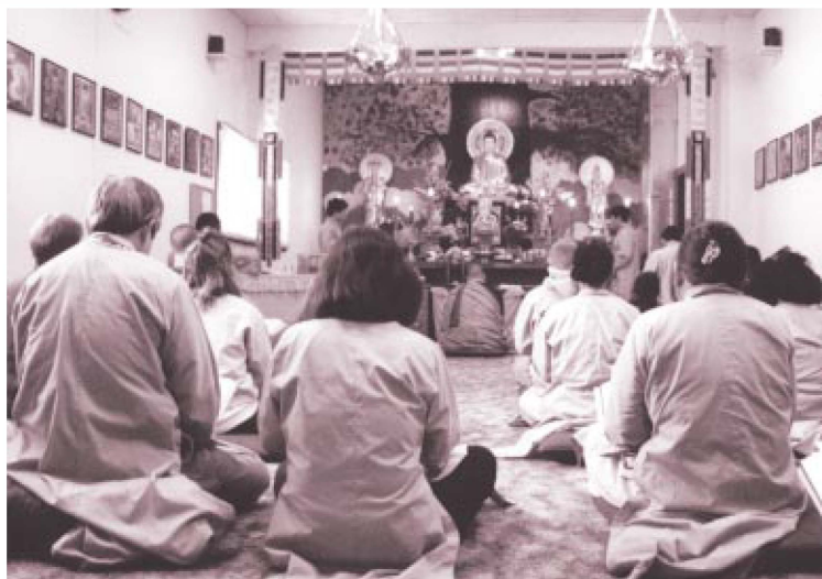
Sunday services, An Lac Buddhist Temple, Indianapolis.

According to a recent Polis Center survey, the Indianapolis area is home to a Buddhist temple, a Baha’i congregation, a Hindu congregation, two Sikh gurdwaras, five Muslim mosques, several Orthodox Christian churches serving various ethnic groups, and about a dozen Korean Christian congregations, ranging in denomination from Catholic to Southern Baptist. The largest group of recent immigrants, Hispanics, are represented by numerous churches. (See the Fall 1998 issue of Religion & Community .)