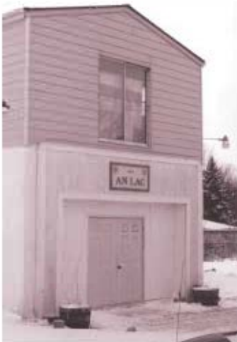
Outside, only the sign indicates this is a place of worship.

In 1965, the U.S. Congress rewrote the nation's immigration laws, resulting in a major increase in immigration from Asia. Locally, Eli Lilly and Company has attracted immigrants from around the world, as has the Indiana University Medical Center, based on the campus of Indiana University Purdue University Indianapolis.