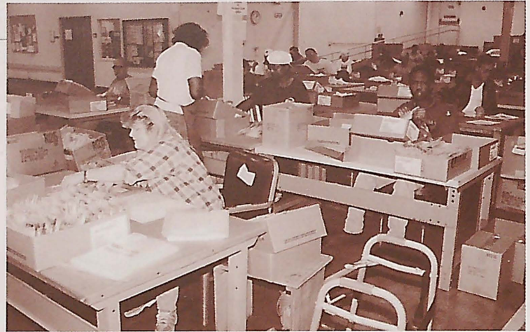
Long involved in training workers for the job market, Goodwill Industries also teaches classes in English as a Second Language.

Faith-based partnerships at their best pool resources among organizations with a common mission. It can be a win-win