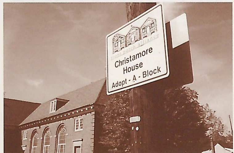
The Front Porch Alliance provided Christamore House, a faith-based community center on the west side, with funding for its after-school program, computers, and fund raising assistance.