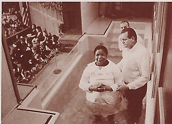
A baptism at Calvary Temple Assembly of God.

As the movement has grown in strength and the country has become more tolerant, many Pentecostal churches, including congregations in Indianapolis, are moving to reclaim their heritage of racial inclusion. “Folks drawn from the lower classes, labor, women’s issues, and race are intimately related in the tradition from the beginning,” Bundy concluded. “In Pentecostalism, it is creedal to believe that they are breaking down barriers of race, gender, and class.”