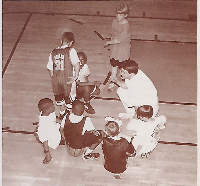
Tabernacle Presbyterian's recreation programs serve members and neighborhood people alike.

"I believe the broader public sees racism as primarily a cultural issue that religion should be addressing in some way," said Farnsley. "I don't think the public is calling for churches to be integrated – but they are asking churches to influence people's attitudes and to stand for a value and an ideal that is widely shared."