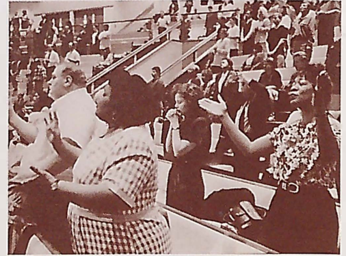
Pentecostal services feature emotional singing and praise.

In less than a century Pentecostalism has grown to attract millions of followers worldwide. “Today we have to think of Pentecostalism as a fourth major branch of