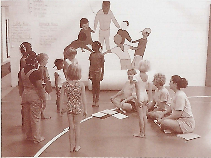
Instruction is a big part of the program at the Jireh Sports Club.