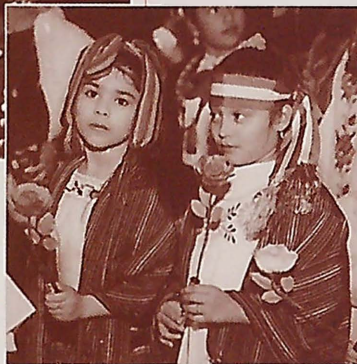
Young girls in festival costume.