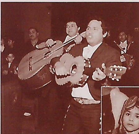
Mariachi musicians entertain at the Festival of the Virgin of Guadalupe, St. Patrick Catholic Church.