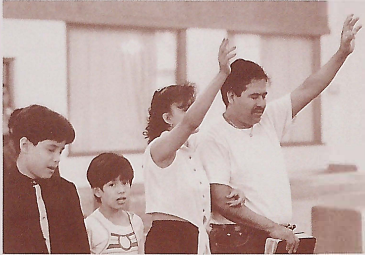
A family worships at Vida Nueva United Methodist Church.