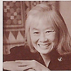
Maxine Hong Kingston

Spirit & Place seeks to create opportunities through the arts and humanities for the public to explore and discuss the relationship between spirituality and community in Indianapolis.