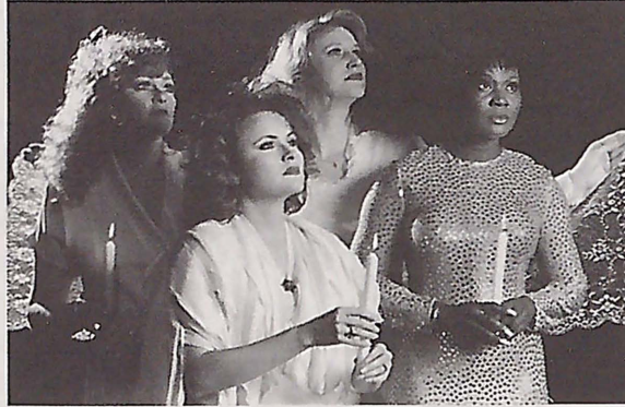
A growing interest in the presence of angels is but one of the contemporary religious themes addressed in the American Cabaret Theatre's production Give Me That New Time Religion .

To receive either publication, contact Denys Pittman at The Polis Center (274-2455).