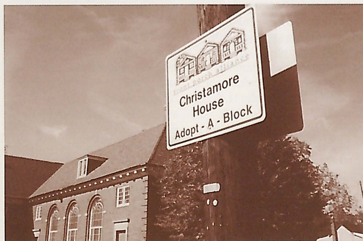
The Front Porch Alliance provided Christamore House, a faith-based community center on the west side, with funding for its after-school program, computers, and fund raising assistance.