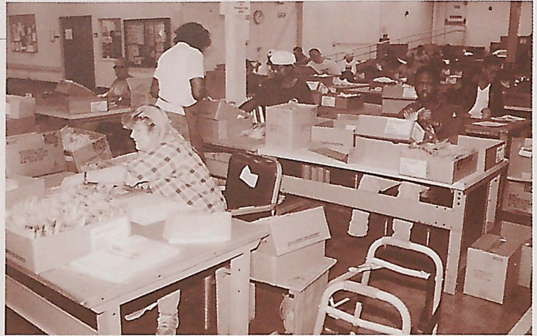
Long involved in training workers for the job market, Goodwill Industries also teaches classes in English as a Second Language.

Faith-based partnerships at their best pool resources among organizations with a common mission. It can be a win-win