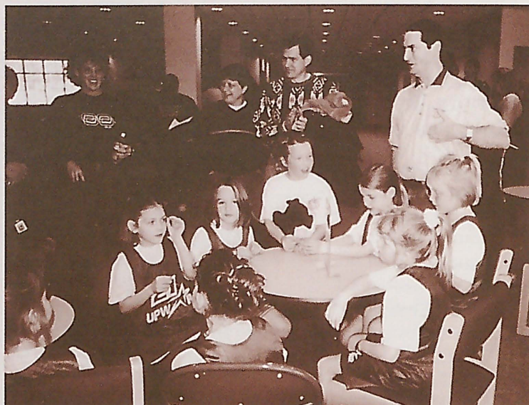
Church and family: the Community Life Center embraces "the two institutions that matter."