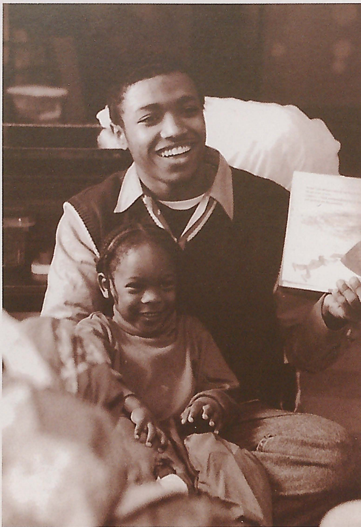
Day care, Holy Trinity Catholic Church: congregations today sponsor an array of services and activities.

East 91 st Street Christian Church in Indianapolis recently opened its new Community Life Center (CLC), featuring extensive facilities for recreation and fellowship. The CLC has a snack bar, kitchen, gymnasium, game room, a lending library, and numerous activity rooms. Members are encouraged to form their own groups around activities such as exercise classes and pitch-in suppers. The center has a children's area with two staff members on duty. For adults, there are aerobics and weight-lifting groups, support groups for those overcoming addictions, and groups that meet to discuss values and work on relationship skills.