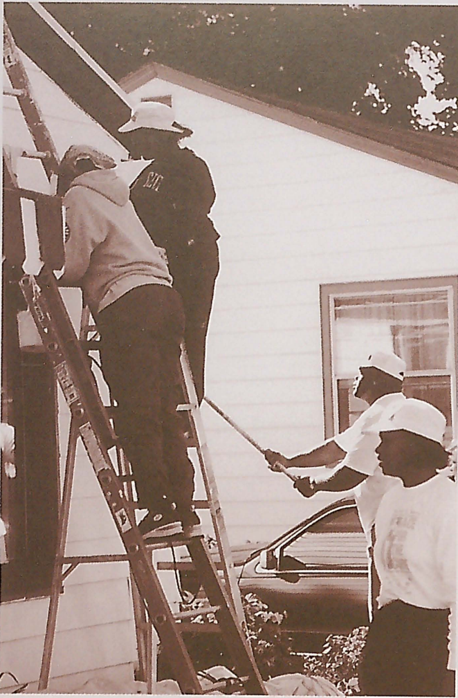
Each autumn, the United Northeast Community Development Corporation sponsors a Volunteer Paint Weekend.