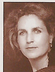
Terry Tempest Williams