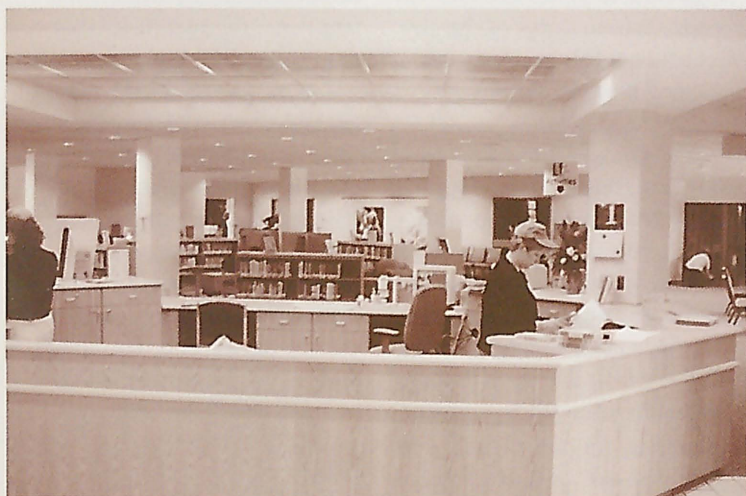
The library at East 91st Street Christian Church's new Community Life Center offers "wholesome" books and videos.