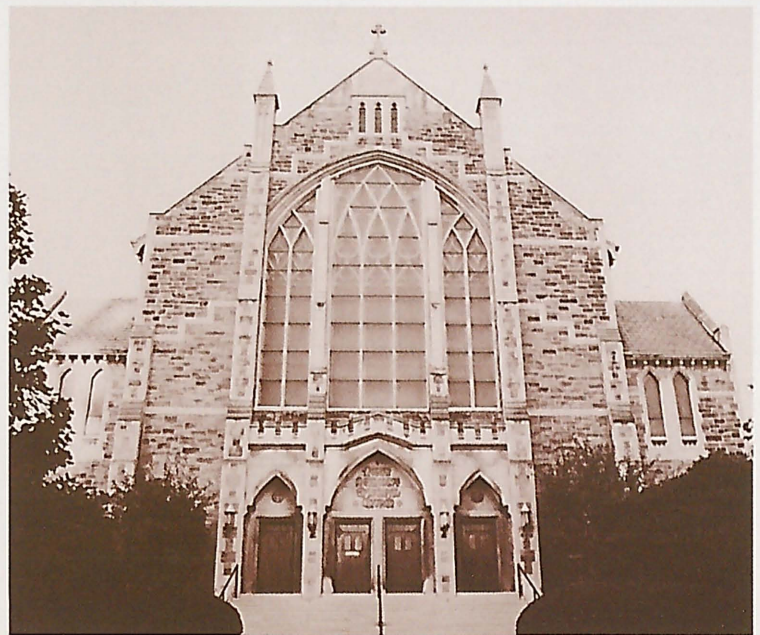
North United Methodist Church was one of the founders of the Mid-North Church Council, which has worked closely with the Mapleton-Fall Creek Neighborhood Association.

process of purchasing a home. Today, the MFCNA has become known as one of the strongest and most active neighborhood associations in the city, and the Mid-North Church Council has been important in its success. The Allison Community Center, which opened in 1992, indicates the Council's continuing commitment to the neighborhood. While Tabernacle Presbyterian owns the building—previously a dentist's office—MFCNA has offices there. Mid-North and MFCNA both sponsor social services and programs out of the building, including a food pantry, legal clinic, medical clinic, and a youth group.