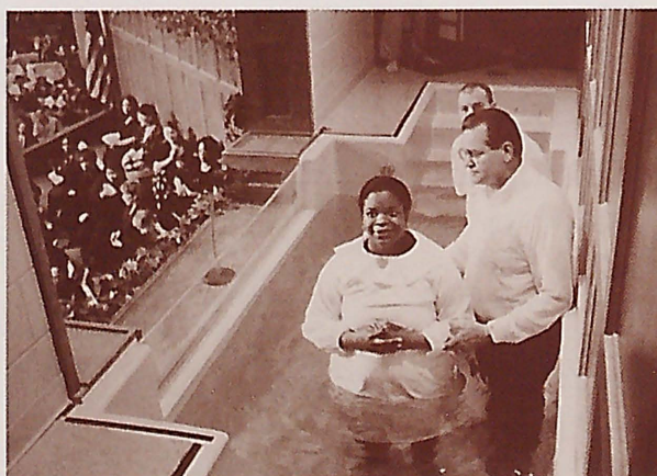
A baptism at Calvary Temple Assembly of God.

As the movement has grown in strength and the country has become more tolerant, many Pentecostal churches, including congregations in Indianapolis, are moving to reclaim their heritage of racial inclusion. “Folks drawn from the lower classes, labor, women’s issues, and race are intimately related in the tradition from the beginning,” Bundy concluded. “In Pentecostalism, it is creedal to believe that they are breaking down barriers of race, gender, and class.”