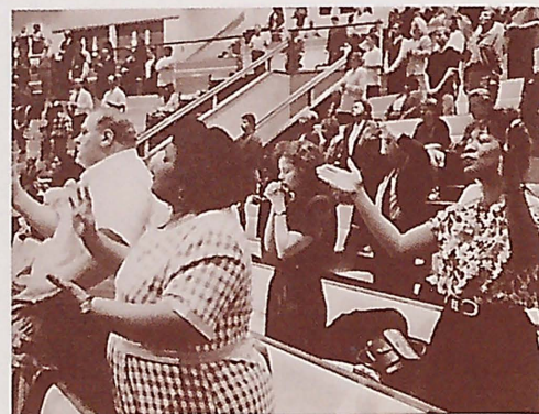
Pentecostal services feature emotional singing and praise.

In less than a century Pentecostalism has grown to attract millions of followers worldwide. “Today we have to think of Pentecostalism as a fourth major branch of